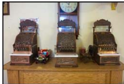
Brothers

Finally got the "three brothers" back together. It took awhile but they are reunited. They all came out of a barber shop in Celina, Ohio. How they ended up by Fort Wayne, Indiana I don't know. Two of them have serial numbers in sequence. The other one skips one. I have the original keys for them and also all three have their own reset wrench.